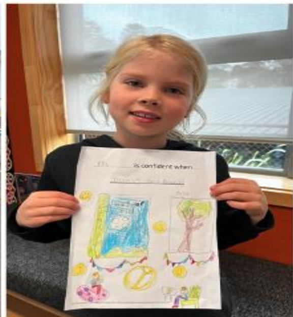
Elle is confident when drawing and reading.