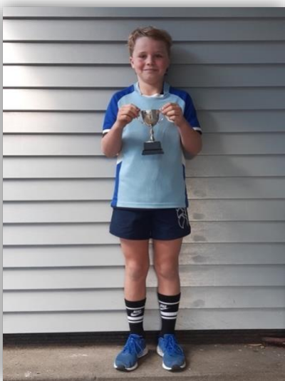
Winnie-Year 5 boys.