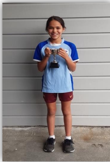
Sana-Year 6 girls.