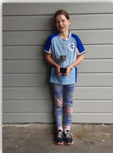
Thea-Year 5 girls.