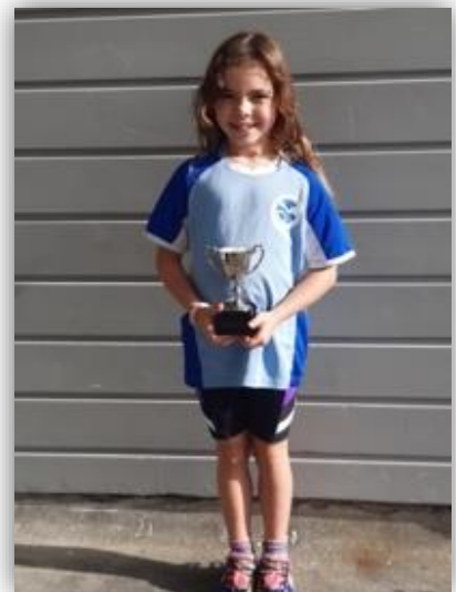
Brannagh-Year 4 girls.