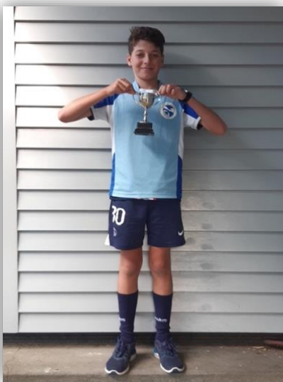
Braydon-Year 6 boys

The following year 4-6 students were the race winners for this year, their names are engraved onto the trophies.